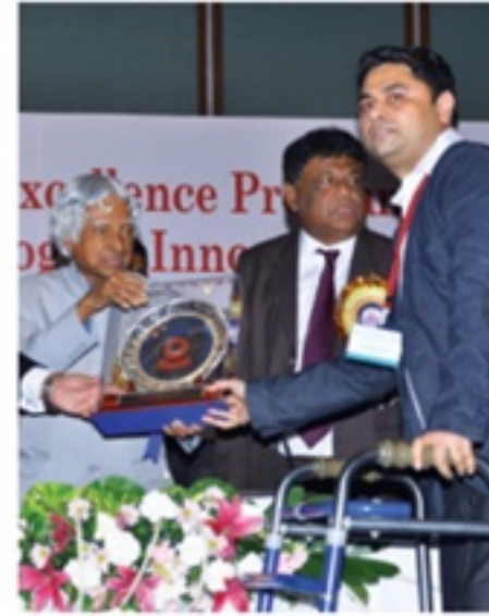
National Award Winner 2010