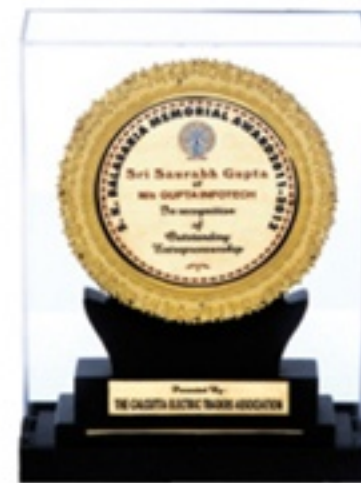
CETA Award 2011