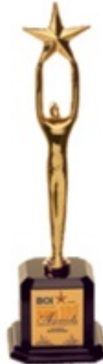
SME Award 2012