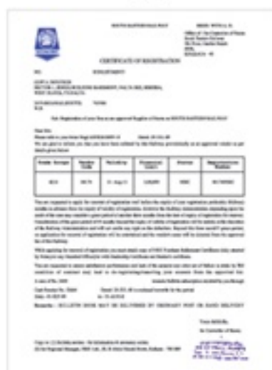
S. E. RAILWAY