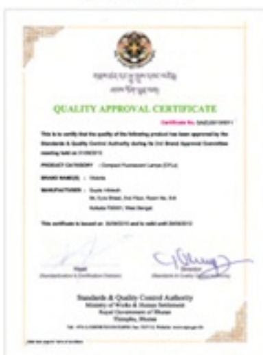
SQCA (Govt of Bhutan)