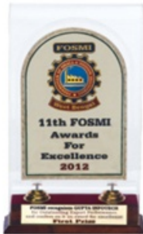
FOSMI Award 2012